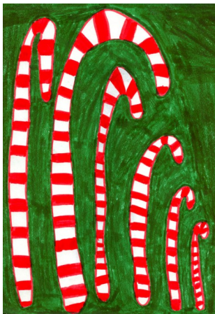
Candy Cane Forrest (pictured above) is one of the five card designs!

Send holiday greetings designed by the children and teens of Pendleton Place to your friends and family this holiday season!